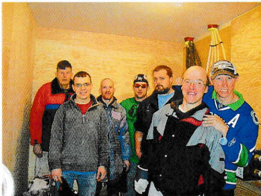
Seven men who now own their own home through Habitat for Humanity and the Phoenix Foundation